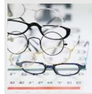
Bring them to the coat room collection bin. Our UMW delivers them to eye doctors who recycle them for those in need!