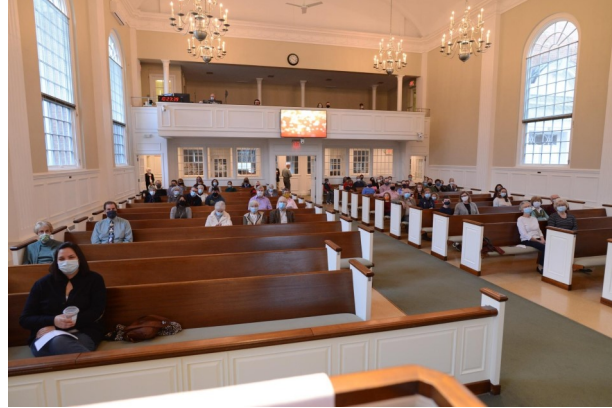
Don Krolikomski captured these two images when he addressed the congregation on Sunday, October 24.