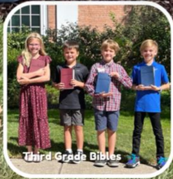
Third Grade Bibles