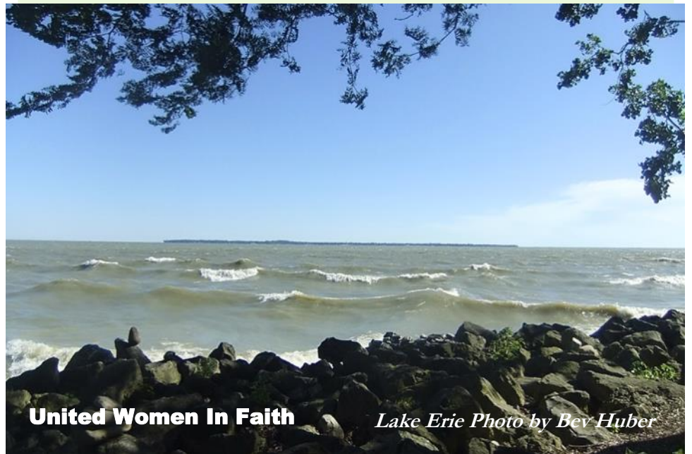
United Women In Faith

Thursday, 10/12. Last year we learned about various Christian denominations, what they believe and what we can learn from them. This year we expand our view and look at various world religions. All are welcome to learn together and share insights. Bring a friend! Bring your own coffee for conversation at 9:30. Program begins at 10 am.