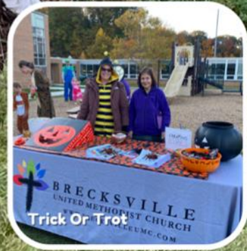
Trick Or Trot