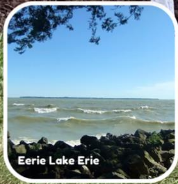
Eerie Lake Erie