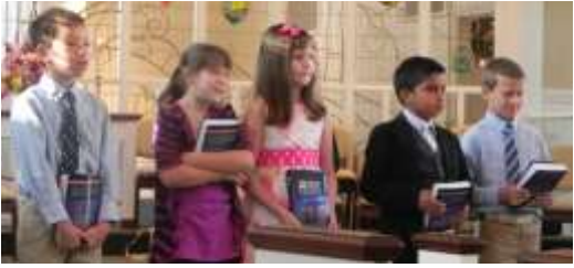
Third Graders Receive their Bibles in 2014