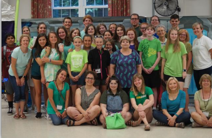
Some of the sixty-plus volunteers from VBS 2019!

with each purchase. This lemonade stand alone brought in over $75 toward our goal. A bake sale that included watermelon slices, snicker doodles and brownies netted over $100. While $3 was earned by a 5 year old who matched all the socks in the laundry basket. All the kids attending generously gave to reach a goal we set on Monday.