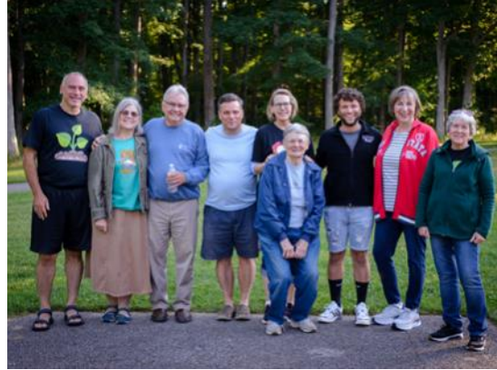
Joyful Gathering—Post-Pandemic Picnic