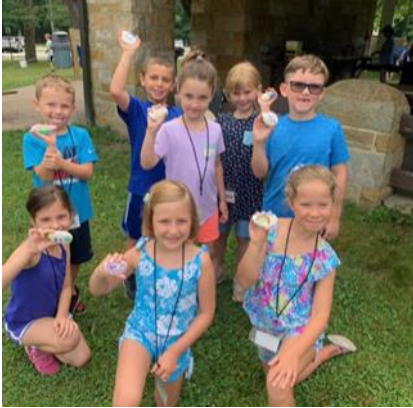
Green VBS Sows Seeds

MONTHLY NEWSLETTER OF BRECKSVILLE UNITED METHODIST CHURCH