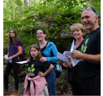
Worship In the Woods