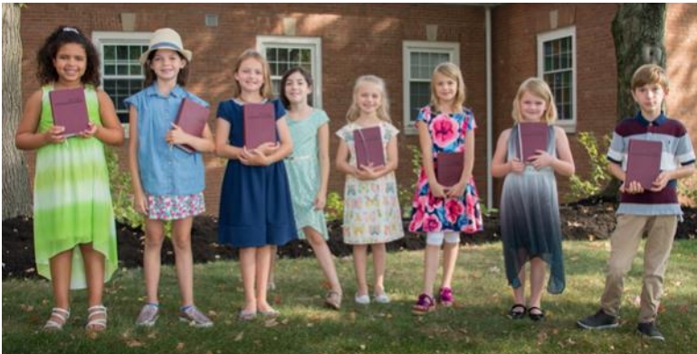
2019 Third Graders with their Bibles

Our older students will receive special tags that include phone numbers of trusted (and background checked) adults who are committed to making themselves available in case of emergency. Students can call or text them at anytime—no questions asked. If you are an adult who feels called to be support for our students in this way, please reach out to Dana Schwendeman ( youth@brecksvilleumc.com ) to add your name to the list!