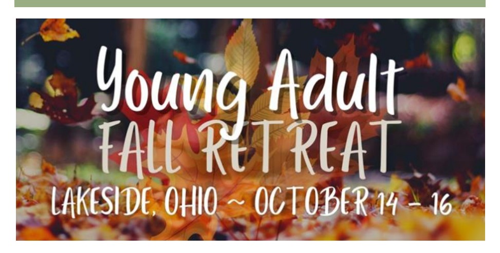
Come to me all you who are struggling and carrying heavy loads, and I will give you rest.—Matthew 11: 21

E-mail <u>youth@brecksvilleumc.com</u> Voicemail 440-526-8938 x 237 www.instagram.com/bumcyouthmin