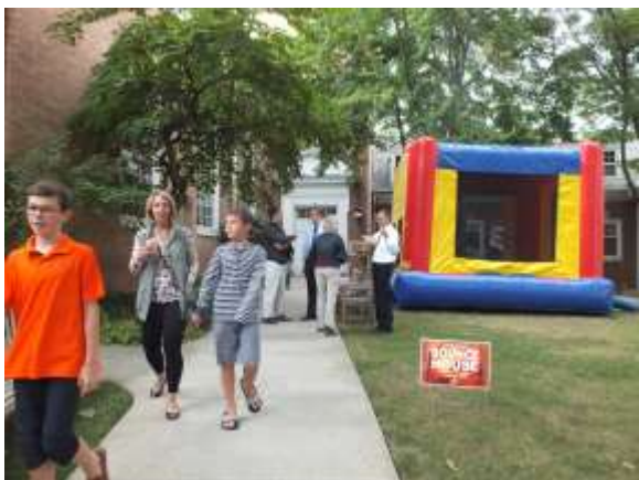
The Bounce House was a big hit with the kids—and kids at heart! (More pictures throughout this issue.)