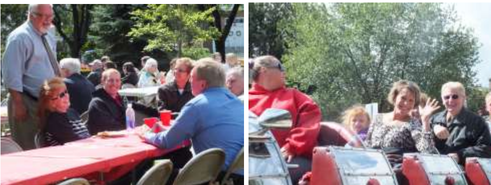
More Fall Kick Off Pics: Although the day started out gloomy, the clouds parted in time to enjoy the sun on the Square. It was a little chilly on the Rocket Car, though!

Starting October 4, on World Communion Sunday, Brecksville United Methodist Church will take part in the 12 Dozen Envelopes drive. Together, we can raise over $10,000 to help provide clothing, food, shelter, and other basic necessities to the world’s refugee population. When you choose an envelope from the display, numbered 1-144, and return it to the offering plate with the minimum pledge amount, you will help us raise over $10,000 to support our brothers and sisters through UMCOR’s International Disaster Relief Fund.