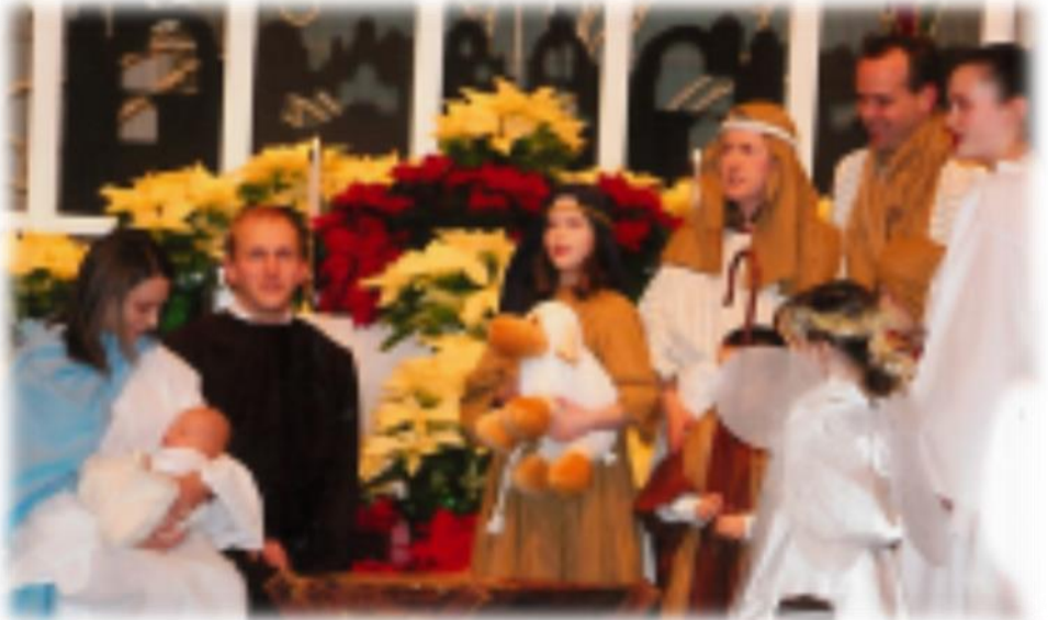
Christmas Eve Family Service, 2013

Christmas Carol Sunday December 28 One worship service at 10 am