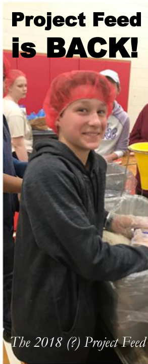
The 2018 (?) Project Feed