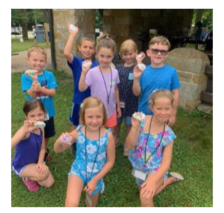
Green VBS Sows Seeds

MONTHLY NEWSLETTER OF BRECKSVILLE UNITED METHODIST CHURCH