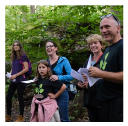
Worship In the Woods