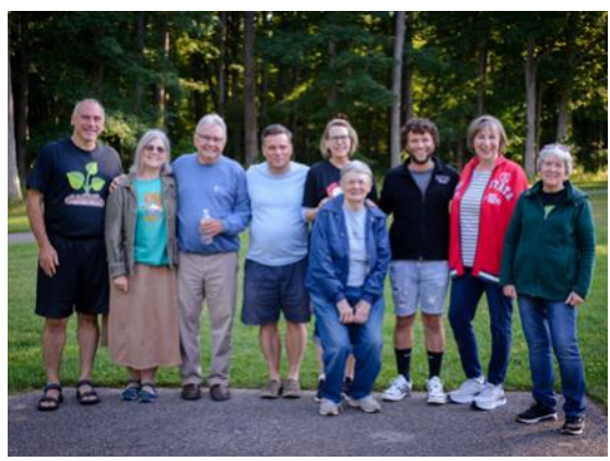
Joyful Gathering—Post-Pandemic Picnic