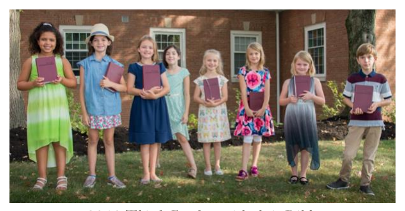
2019 Third Graders with their Bibles

Our older students will receive special tags that include phone numbers of trusted (and background checked) adults who are committed to making themselves available in case of emergency. YOUTH@BRECKSVILLEUMC.COM! Students can call or text them at anytime—no questions asked. If you are an adult who feels called to be support for our students in this way, please reach out to Dana Schwendeman (youth@brecksvilleumc.com) to add your name to the list!