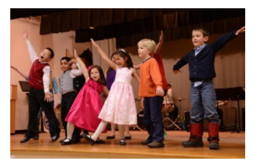
Some of our talented performers!

We had a wonderful Student Recital on Saturday, March 16. Ten of our own BUMC youth played piano, saxophone, flute, violin and sang. Thank you to all the performers and their teachers for an evening of wonderful music! Look for the First Annual Music Scholarship recipients to be announced soon!