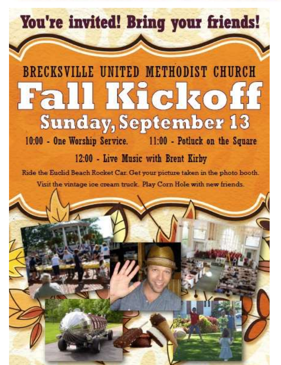
We have so much to celebrate: the blessing of another year, the fellowship of our church family, and the many gifts we share together in this community. We are excited to kick off a new program year with great food, fellowship, and wonderful music!