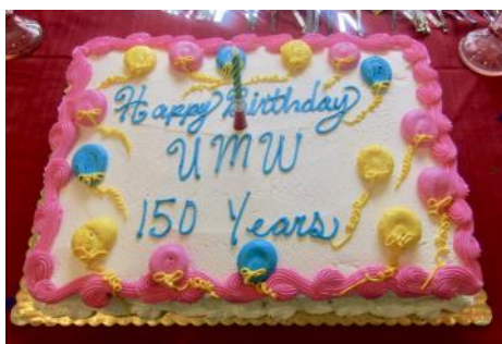
At the March UMW Meeting, we celebrated 150 years in mission. Happy Birthday, United Methodist Women!

Why slave over a hot oven? Let the United Methodist Women do the baking for you! Shop the UMW Palm Sunday Bake Sale before or after church services on April 14. Your purchases support the UMW Mission Fund which benefits programs supporting women and children locally and around the world. Calling all bakers! Want to donate to the sale? Bring your treats to the church kitchen (wrapped for individual sale) on Saturday, April 13 between noon and 3 pm. Thank you!