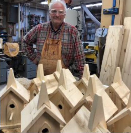
The Birdhouse Project