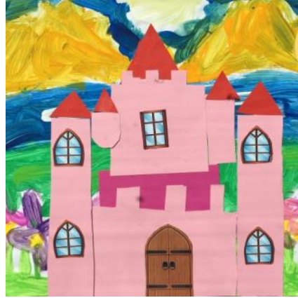
VBS Comes Home