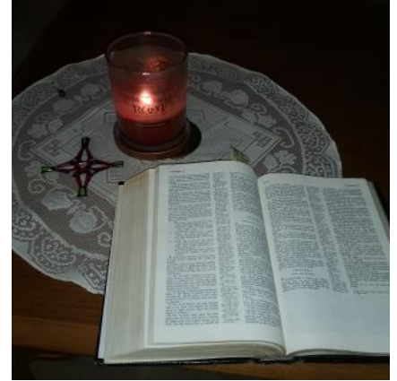
Worship Where You Are