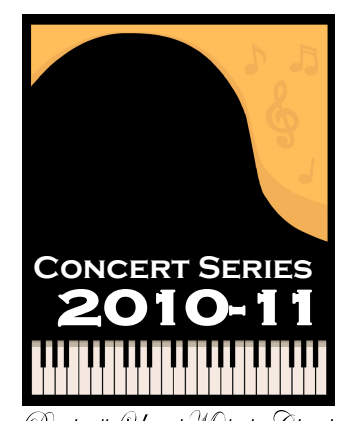
Brecksville United Methodist Church