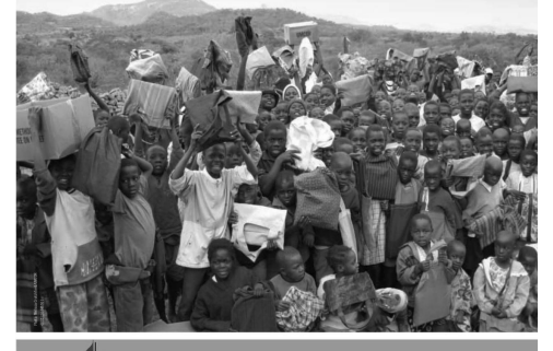
B e There. Be Hope. Larm more bottlet for all four of Sharing

For more than 70 years, UMCOR has brought hope and solidarity to communities both at home and abroad.