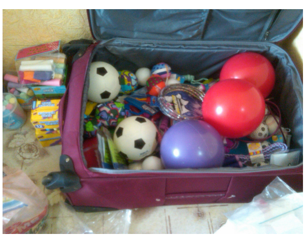
Your donations on their way to Russia!

65 Public Square Brecksville, Ohio 44141 440-526-8938 Open Doors. Honest Worship.