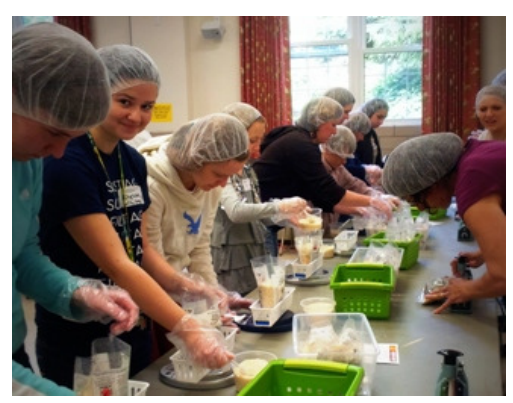
Music played while we filled the meal bags.