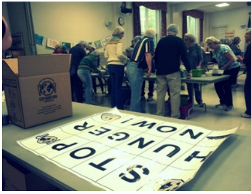
Fellowship Hall was filled with activity.