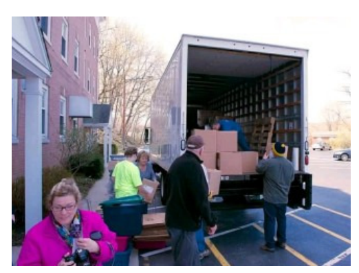
The first boxes are loaded into the truck. (See more pictures on the church Facebook page!)

Proverbs 16:3 tells us, "Commit to the Lord whatever you do, and your plans will succeed." (NIV) That is a lesson and a promise we were all able to experience on April 21 at our second annual "Workship" event.