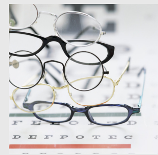
Bring them to the coat room collection bin. Our UMW delivers them to eye doctors who recycle them for those in need!