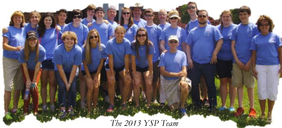
The 2013 YSP Team