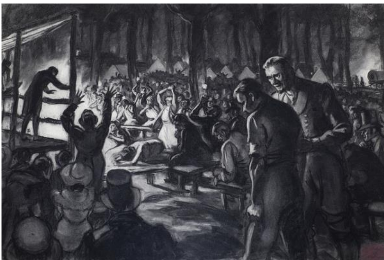
Original Charcoal Drawing, courtesy of United Methodist News Service

storm." Circuit riders preached extemporaneously, or from a rough outline and used common language. They won the working class over better than the schooled Calvinists. Their "libraries" were often no more than a Bible and sometimes a book or two of commentary. It was said that wherever the Methodists went, their plain and simple, warm and animated mode of preaching always gathered a crowd.