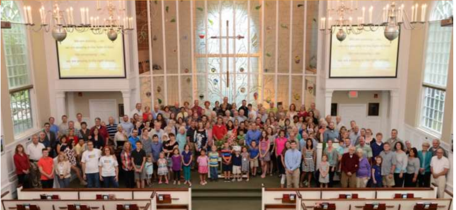
Our Church Family Photo, Taken on Fall Kick Off Sunday, September 11, 2016

Archived at www.brecksvilleumc.com/root/bumonline/Newsletter