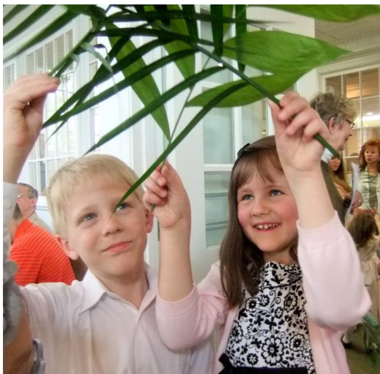
Palm Sunday 2014